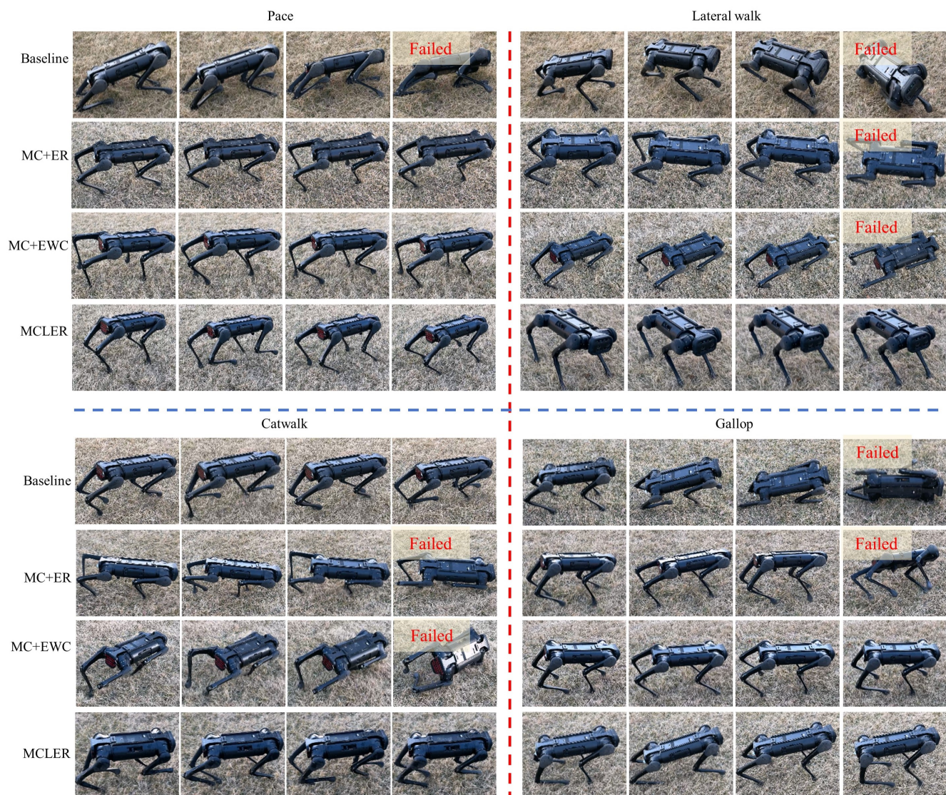
Fig. S2. The comparison of gaits learned by different methods deployed in the real-world.